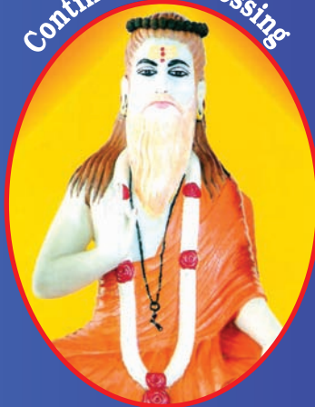
Siddh Shiromani Baba Mast Nath Ji