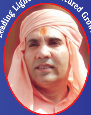
Mahant Chand Nath Ji Yogi Founder Chancellor